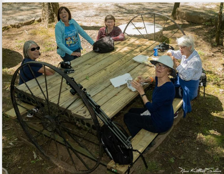
Enjoying the day