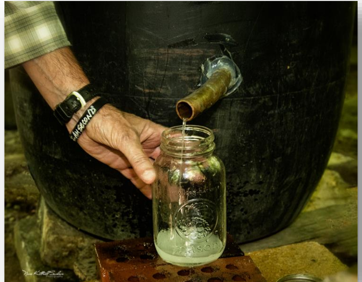
Neva Scheve, The Still