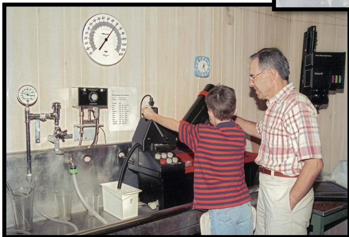
Figure 2: Introducing my grandson to color printing, June 1998, in my Whispering Pines darkroom